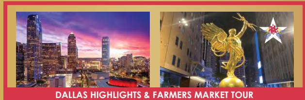
DALLAS HIGHLIGHTS & FARMERS MARKET TOUR