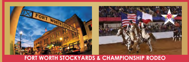
FORT WORTH STOCKYARDS & CHAMPIONSHIP RODEO

CANCELLATIONS Please see the cancellation policy at GoldenGlow.org