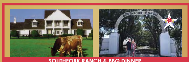
SOUTHFORK RANCH & BBQ DINNER