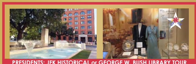
PRESIDENTS: JFK HISTORICAL or GEORGE W. BUSH LIBRARY TOUR