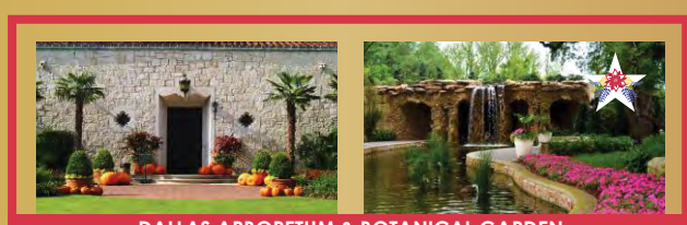
DALLAS ARBORETUM & BOTANICAL GARDEN