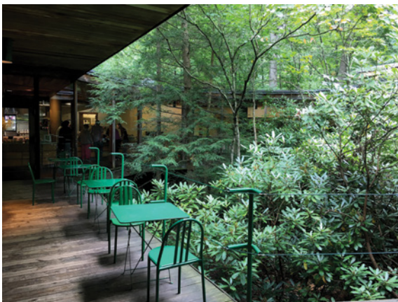
Fallingwater Visitor Center