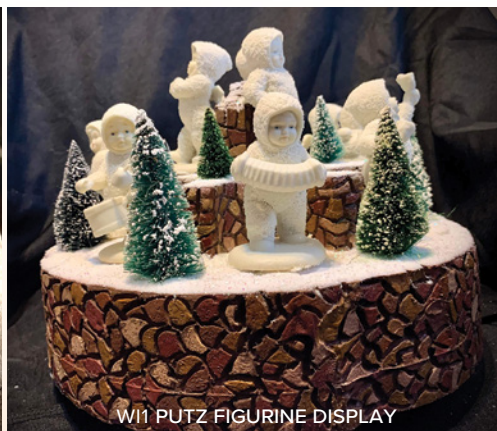
W11 PUTZ FIGURINE DISPLAY