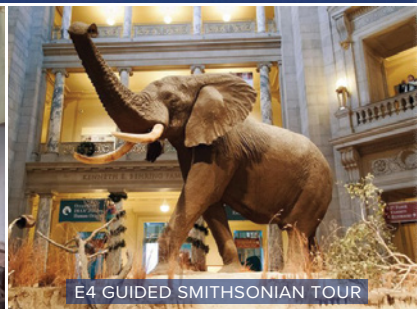
E4 GUIDED SMITHSONIAN TOUR