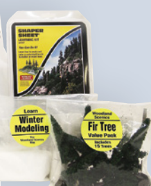
WINTER MODELING KIT