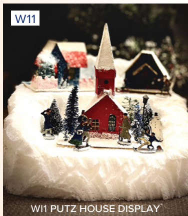
W11 PUTZ HOUSE DISPLAY