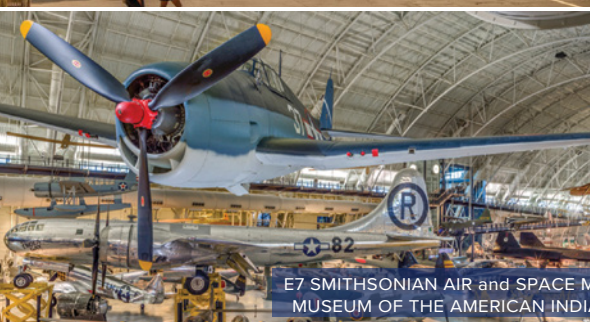
E7 SMITHSONIAN AIR and SPACE MUSEUM & MUSEUM OF THE AMERICAN INDIAN TOUR