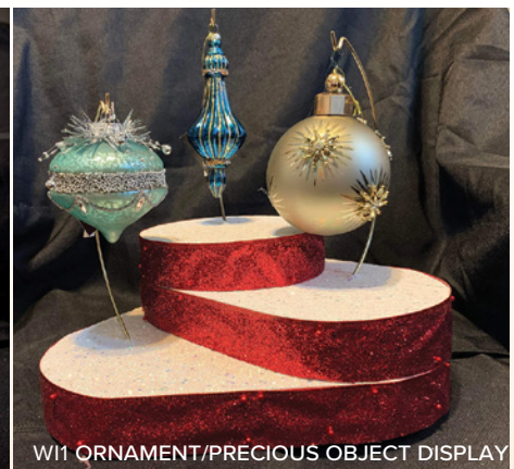
W11 ORNAMENT/PRECIOUS OBJECT DISPLAY