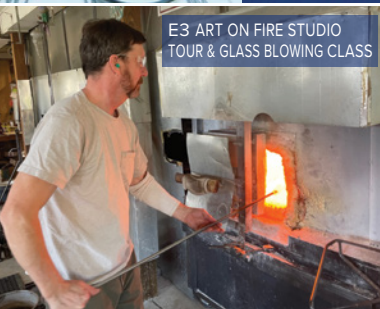
E3 ART ON FIRE STUDIO TOUR & GLASS BLOWING CLASS