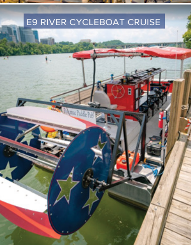
E9 RIVER CYCLEBOAT CRUISE