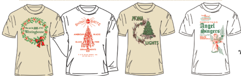
MOCK-UPS OF APPAREL DESIGNS

The design on top features Randy Doler's Patriotic Tree, 2016 Rye Convention