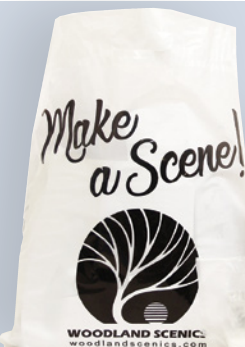
SHAPER SHEET® LEARNING KIT