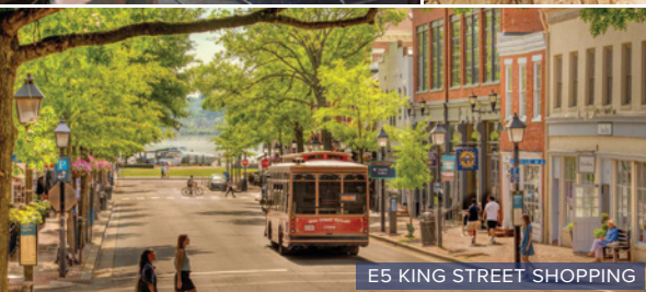
E5 KING STREET SHOPPING