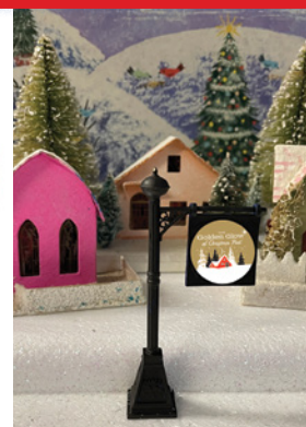
M2 VILLAGE SIGN POST