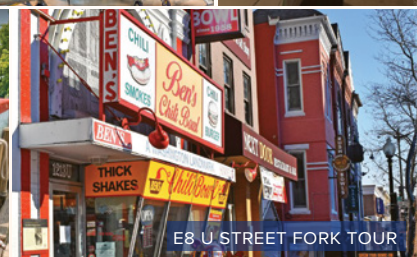
E8 U STREET FORK TOUR