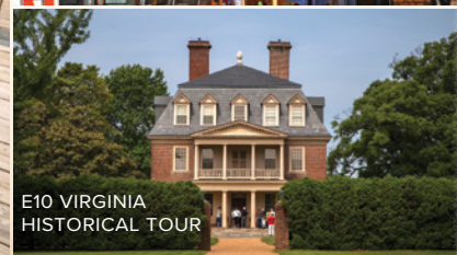
E10 VIRGINIA HISTORICAL TOUR

When was the last time you made a memory in DC?